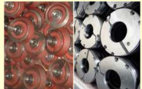
Cast Iron Hubs