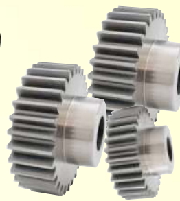
Gears & Gear Blanks