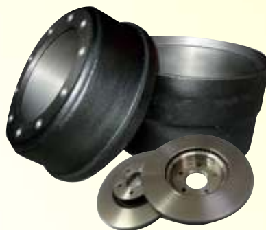
Brake Drums & Discs